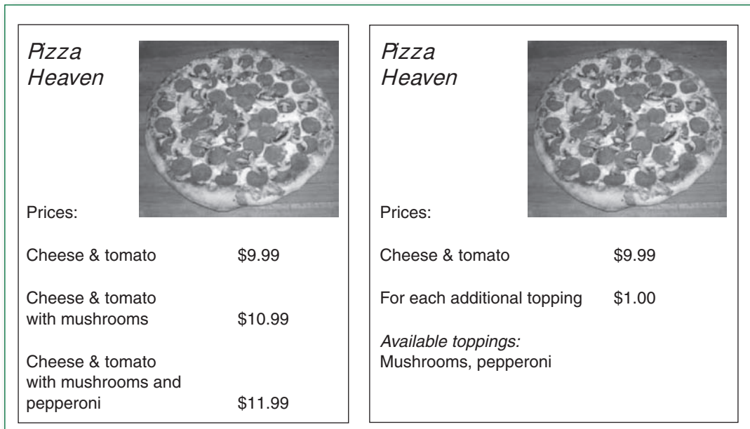
Figure 1.5 Alternative Price Formats for a Mushroom and Pepperoni Pizza

Price format also involves the question of how many numbers are required to express an item's price. For example, a price advertisement could directly show the price of a mushroom and pepperoni pizza, or it could express that price as a base price plus an additional amount for the two toppings (see Figure 1.5). The price of a lamp in a home furnishings catalog might be expressed as a price for the lamp that includes shipping or as a price for the lamp alone along with a separate price for the shipping of the lamp to the purchaser. The question of whether a price should be expressed as a single number or as the sum of more than one number is the issue of price partitioning .